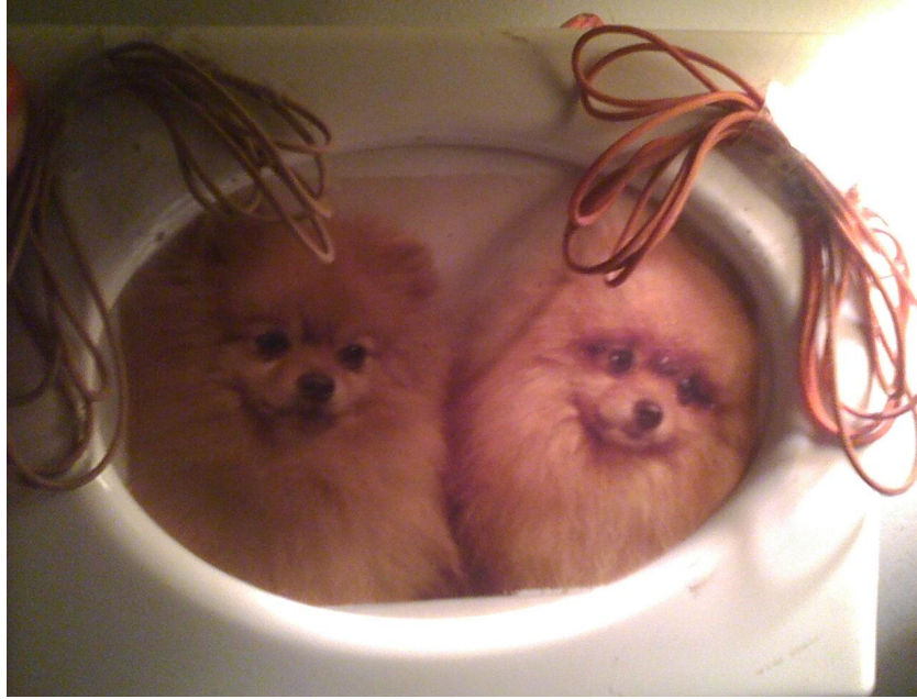
CH Solo and CH Sarah Our first two champions Gone now but never forgotten